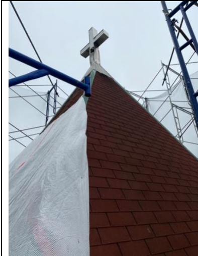
Bell tower roof existing