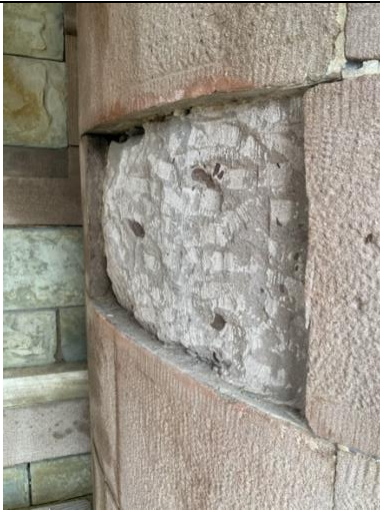
Stone removed for a 'dutchman' repair