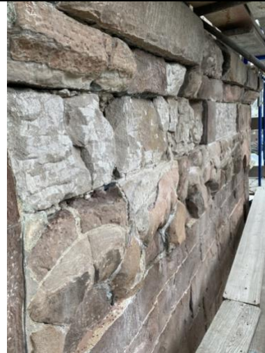
Bell tower façade stone