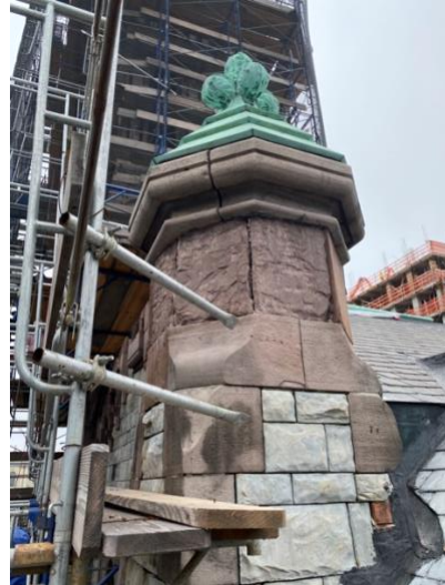
Cleaned stone ready for repairs