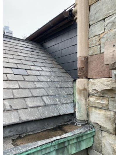
Roof and façade junction above entry