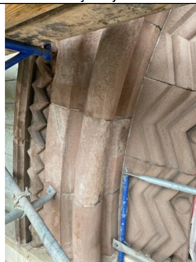
Stone decoration to large 'rose' window