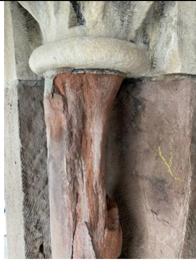
Deteriorated stone column on bell tower