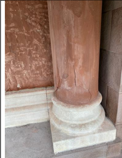
Stone column above entry