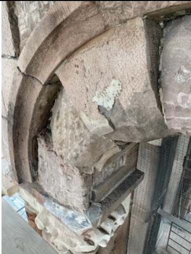
Stone repair preparation on bell tower