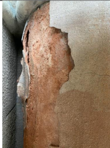
Stone spalling typical on columns