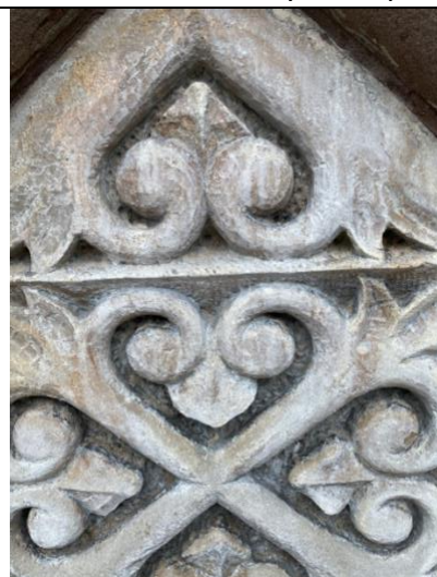
Stone decoration above main entry