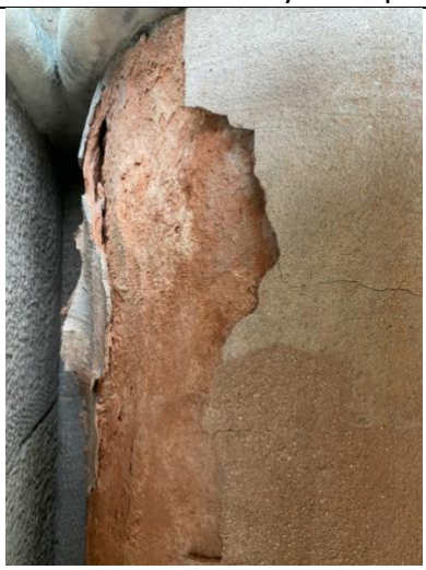
Stone spalling typical on columns