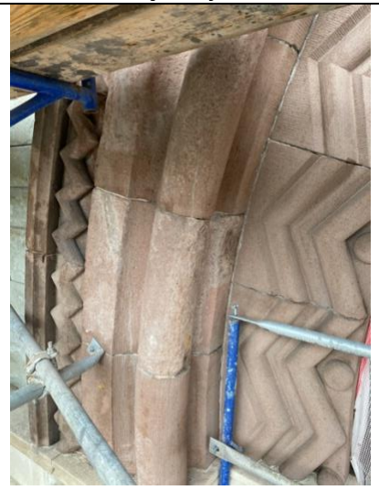
Stone decoration to large 'rose' window