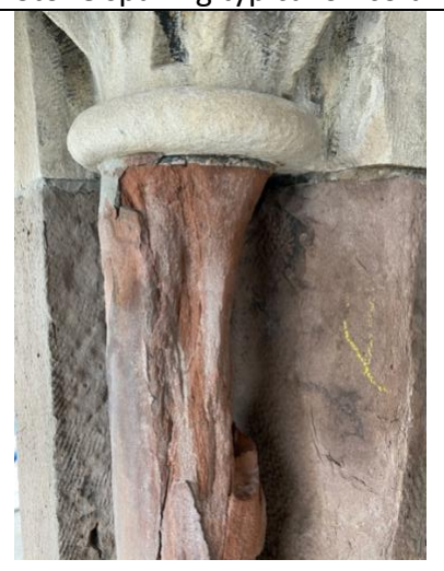
Deteriorated stone column on bell tower