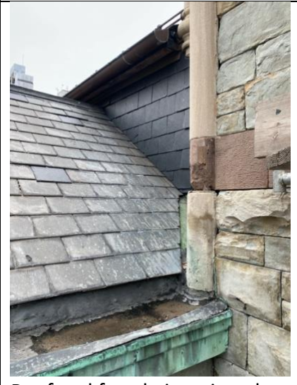
Roof and façade junction above entry