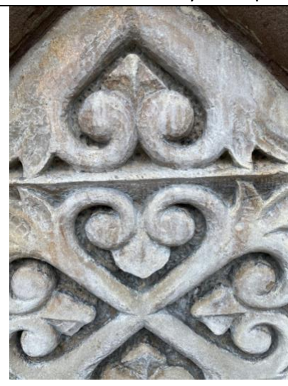
Stone decoration above main entry