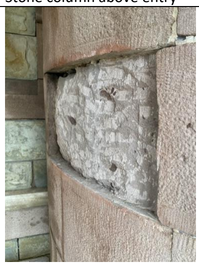
Stone removed for a 'dutchman' repair