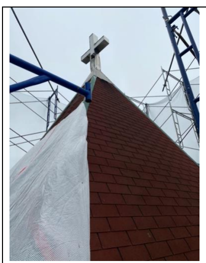
Bell tower roof existing