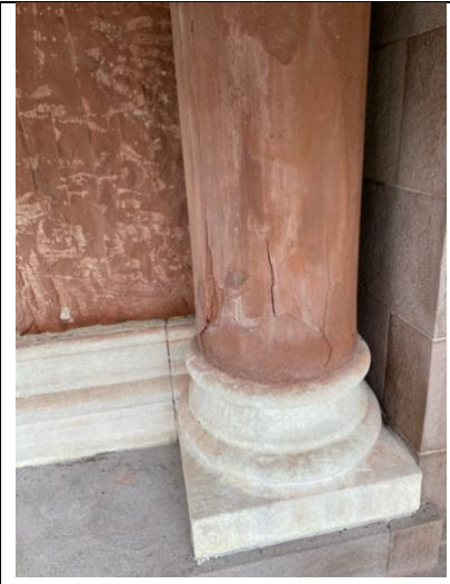
Stone column above entry