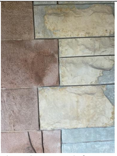
Cleaned stone ready for repointing