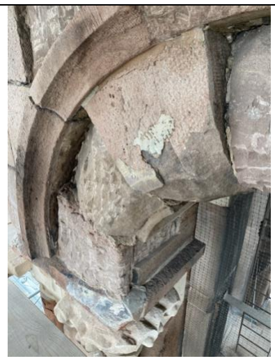
Stone repair preparation on bell tower