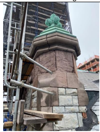
Cleaned stone ready for repairs