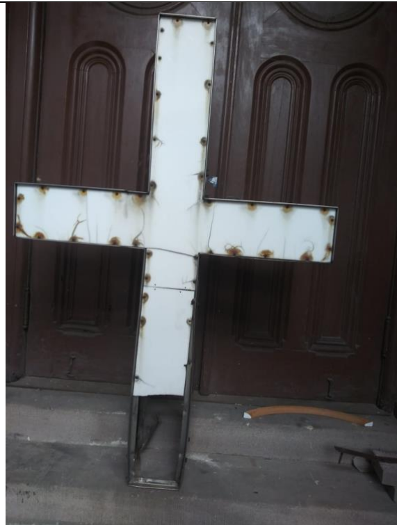
Old cross from Parish hall. Being replaced with 8' stone cross to match church