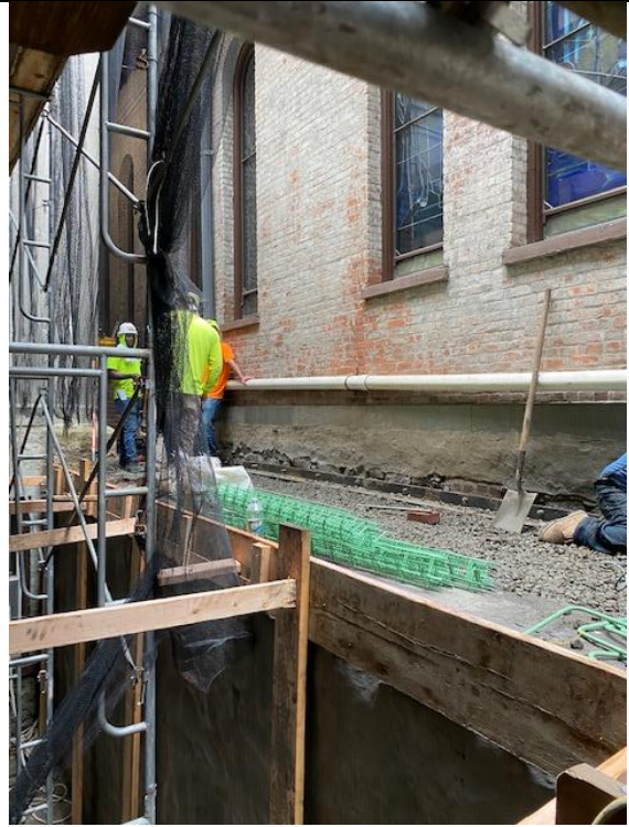
Preparing for new courtyard upper slab