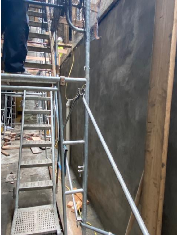
New facing to courtyard wall before painting