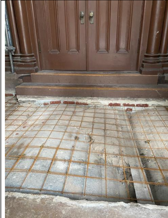
Entry porch prior to concrete slab