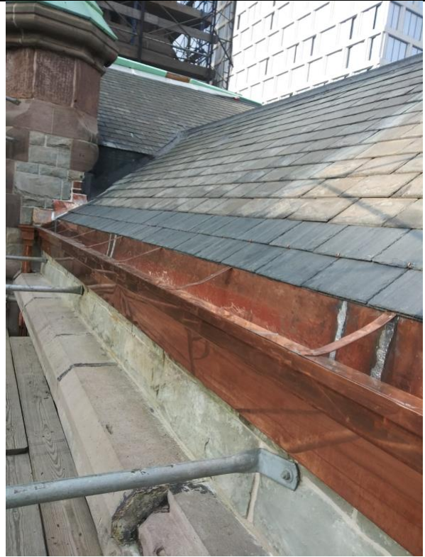
New copper gutter