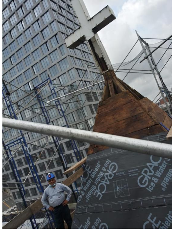
Bell tower roof under repair