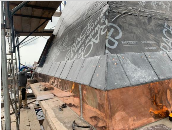
New copper gutter and slate at bell tower